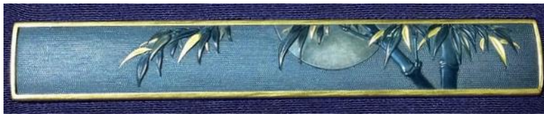
Kozuka Knife Handle Decorated with Bamboo and Full Moon by Natsuo Kanō