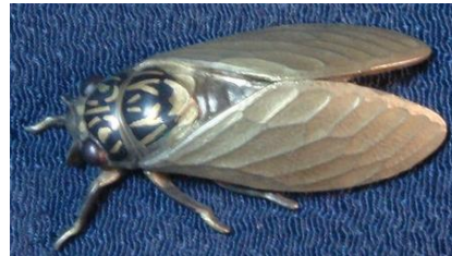
Metalwork by Kōshirō Izumi