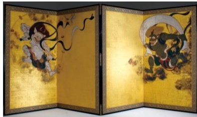
Folding Screen Featuring Wind and Thunder Gods